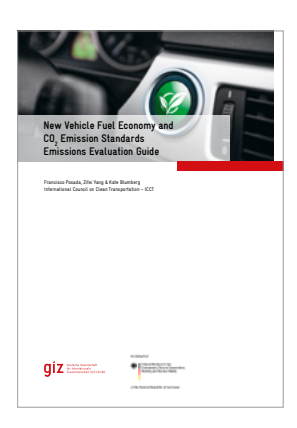
FESET enables countries to analyse impacts of Fuel Economy Standards, one of the most effective transport mitigation actions (in partnership with the ICCT).