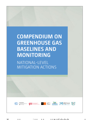
Together with the UNFCCC secretariat and other partners, GIZ compiled more than 30 methodologies for 8 different transport mitigation actions.

Any methodology that is developed or selected needs to consider the causal chain of the mitigation mechanism, i.e. what are key impact factors on reducing emissions (e.g. shifting travellers to other modes, improving efficiency of vehicles or changing carbon content of fuels). It further needs to specify data that are obtainable from existing sources or within the given budget and meet the accuracy and verifiability requirements appropriate to the purpose of analysis.