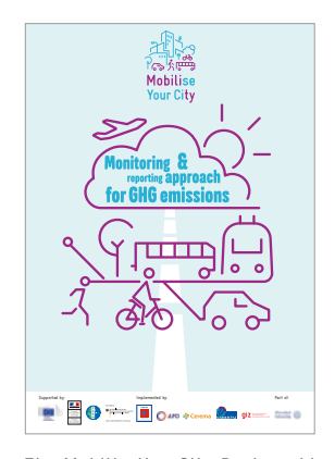
The MobiliseYourCity Partnership (implemented by GIZ and AFD) provides guidance for partner cities to quantify emissions of SUMPs.

On city-level, a GHG inventory of transport emissions can also help to engage in international initiatives or partnerships. For example the MobiliseYourCity Partnership (MYC) provides a framework for 100 cities to develop Sustainable Urban Mobility Plans (SUMPs). As these plans bundle a number of actions in a defined territory, GHG inventories can be used to monitor the impacts of the plan. The MYC Monitoring & Reporting Approach for GHG Emissions describes the principles for participating cities. The paper Balancing Transport Greenhouse Gas Emissions in Cities reviews emission accounting practices in Germany and illustrates how six cities cope with the challenge.